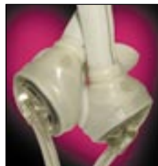
70cc artificial heart